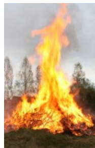
An unattended fire can quickly get out of control.

Recreational fires also must not produce a large amount of smoke that creates offensive or objectionable conditions that interfere with neighboring residents' use and enjoyment of their property.